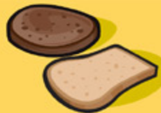
Bread 1 slice (35g)