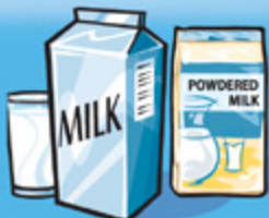
Milk or powdered milk (reconstituted) 250 mL (1 cup)