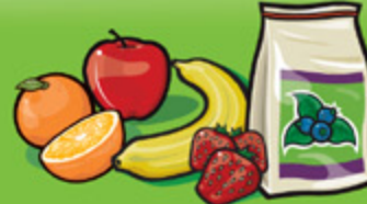
Fresh, frozen or canned fruits 1 fruit or 125 mL (½ cup)