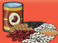
Cooked legumes 175 mL (¾ cup)