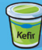
Kefir 175 g (¾ cup)