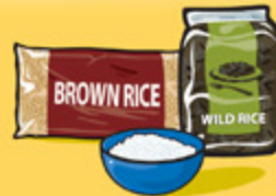
Cooked rice, bulgur or quinoa 125 mL (½ cup)