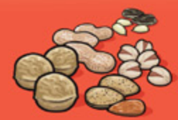
Shelled nuts and seeds 60 mL (¼ cup)