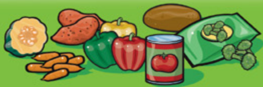
Fresh, frozen or canned vegetables 125 mL (½ cup)