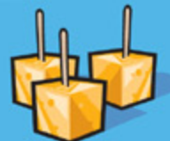
Cheese 50 g (1 ½ oz.)