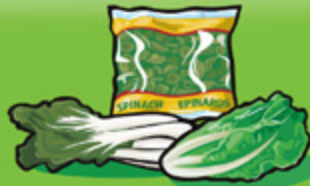
Leafy vegetables Cooked: 125 mL (½ cup) Raw: 250 mL (1 cup)