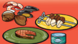
Cooked fish, shellfish, poultry, lean meat 75 g (2 ½ oz.)/125 mL (½ cup)