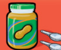
Peanut or nut butters 30 mL (2 Tbsp)