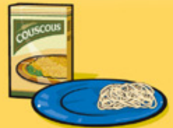
Cooked pasta or couscous 125 mL (½ cup)