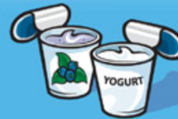
Yogurt 175 g (¾ cup)